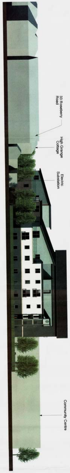
2 South Elevation to Roseberry Road 1:1