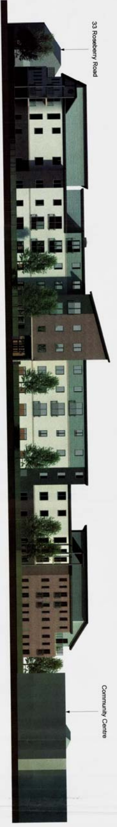
1 East Elevation to the Causeway 1:1