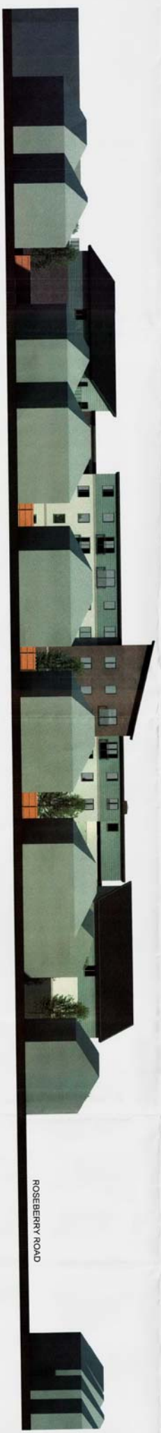
3 West Elevation to Sidlaw Road 1:1